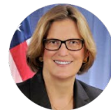
Kathryn Sullivan, PhD

Former Head of NASA and retired Marine Corps General