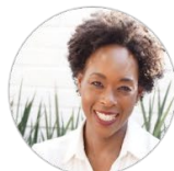
Margot Lee Shetterly, CFA