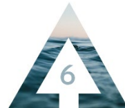
Our Internship Program