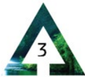
1% for the Planet