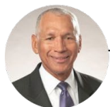
Charles Bolden Jr.

Former Head of NASA and retired Marine Corps General