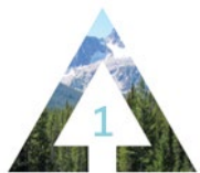
Our Founding Story