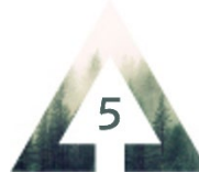
Our Advisory Board