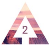
Low-Carbon Economy & SBTs